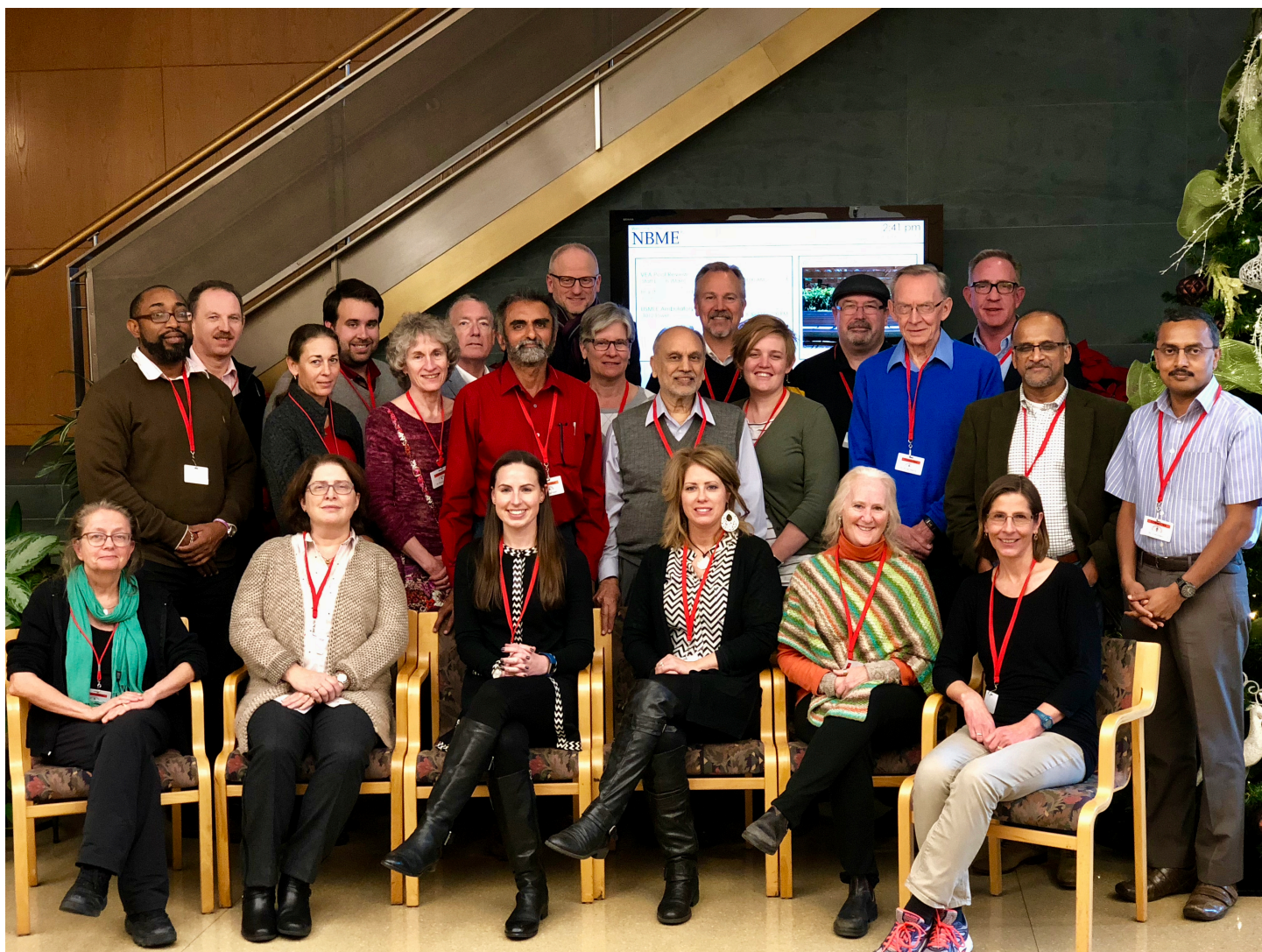
Above: Meeting participants attending the December 7-8 VEA Pool Review Meeting in Philadelphia, PA