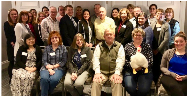
NAVLE Pool Reviewers, ICVA staff and board members, and NBME staff at the January 17-18 meeting.

May 9 , Academic Working Group meeting, Chicago, IL