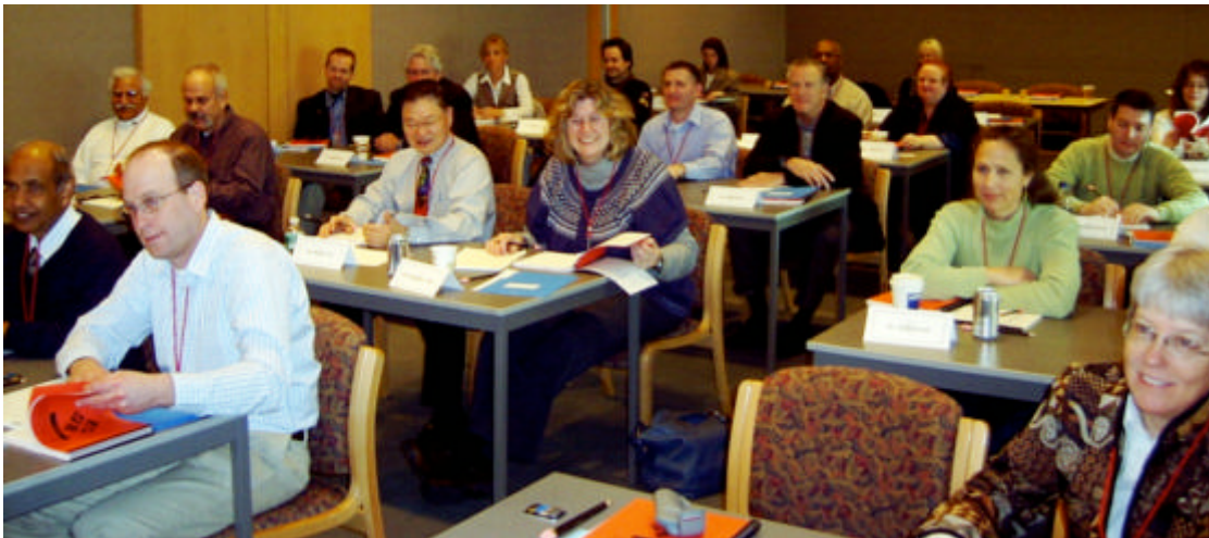
NAVLE and QE item writers at the Item Writing Workshop in Philadelphia on February 24, 2009

Forms of the QE to be administered in September 2009 and January and May 2010 were reviewed and approved by ten 2009 QE item writers at the NBME office on February 25.